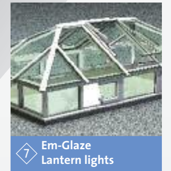
7 Em-Glaze Lantern lights

Call us on 01483 271371 or take a look at our interactive roof at www.whitesales.co.uk