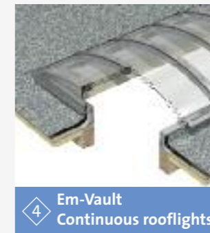
4 Em-Vault Continuous rooflights