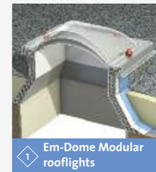
1 Em-Dome Modular rooflights