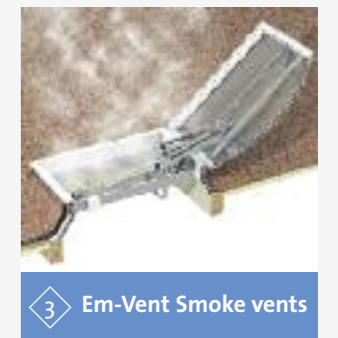
3 Em-Vent Smoke vents