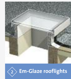
2 Em-Glaze rooflights