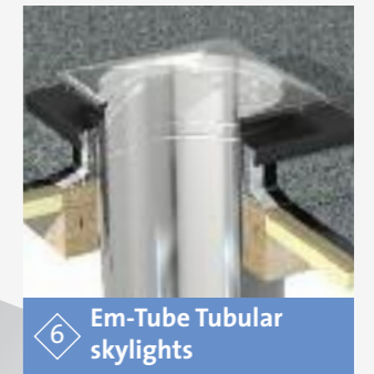
6 Em-Tube Tubular skylights