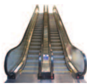
Escalators and Moving Walkways