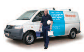
Lift Service and Repair