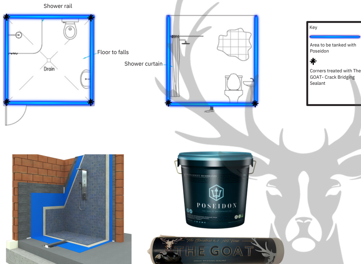
Figure 2: Typical wet room

Gypsum based plaster and plasterboard or calcium sulphate screed should not be used as a substrate in a wet room or where a power shower is to be installed, regardless of any tanking provision.