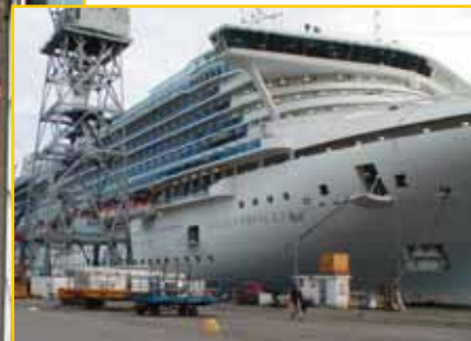
GOLDEN PRINCESS Monfalcone - Italy Products used: KERALASTIC, KERALASTIC T