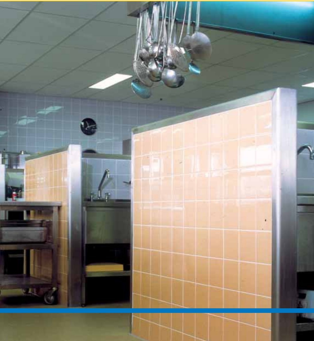
P.I.O.G - Ossendrecht - Netherlands Products used: MAPEBAND, MAPEGUM WP, ULTRAMASTIC III, KERACOLOR FF