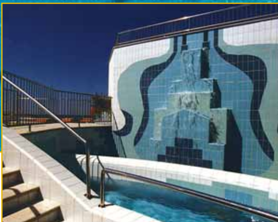
AQUATIC PARK - Grado (Gorizia) - Italy Products used: NIVOPLAN, MAPELASTIC, MAPEBAND, KERACRETE, KERAPOXY, MAPESIL AC