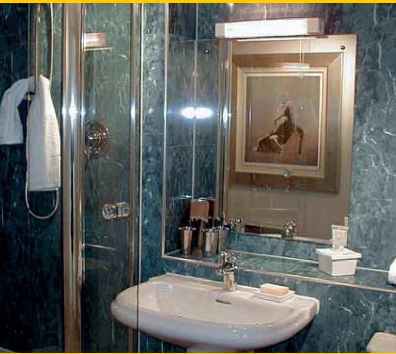
BIRMINGHAM MAILBOX - Birmingham - England Products used: ADESILEX P25, MAPESIL AC, ULTRACOLOR