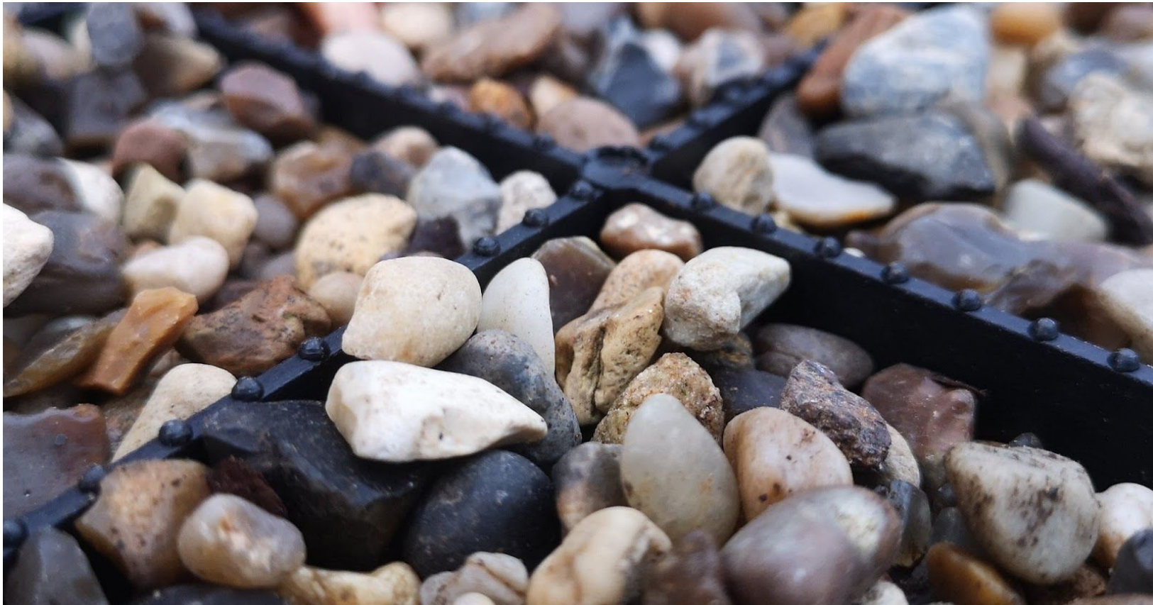
IBRAN permeable gravel retention grids