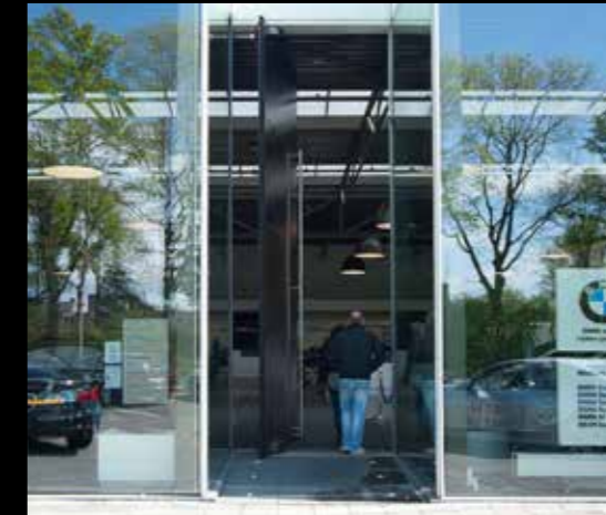
THE BAUPORTE VISION